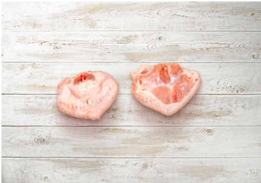
Turkey tail, approx. 10 kg crt Product code: FI 2732