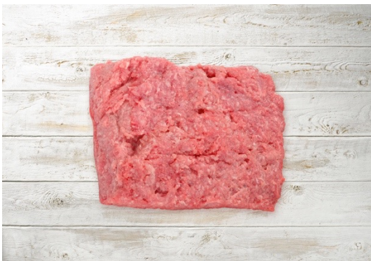
2152 / 2134 Turkey MSM Mechanically separated turkey meat. Fat content approx. 18-22%.