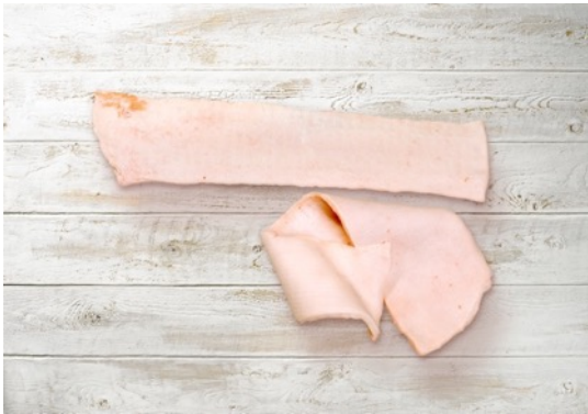
Pork back fat Pork back fat, rindless. Product code: FI 2932