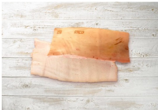
Pork belly rind Product code: FI 8463, SE 507701