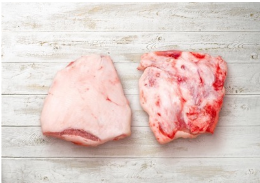
Pork jowl Pork jowl , rindless Product code: FI 2936