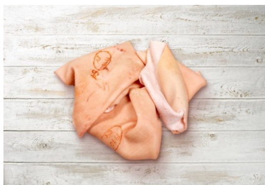
Pork rind Pork rind, mixed. Product code: FI 2928

For specification, please contact our sales team .