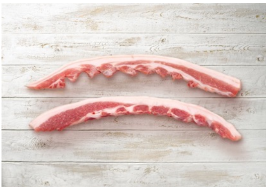
Pork belly strips Pork belly strips, rindless. Approx. 50% C.L. Product code: FI 3572, SE 505002

For specification, please contact our sales team .