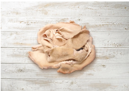
Beef tripe Product code: EE 1431

For specification, please contact our sales team .