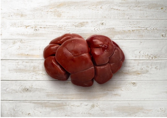
Beef kidney Product code: FI 9269, SE 322303