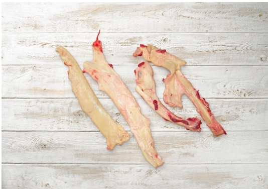
Beef tendons Product code: FI 3396, SE 529927